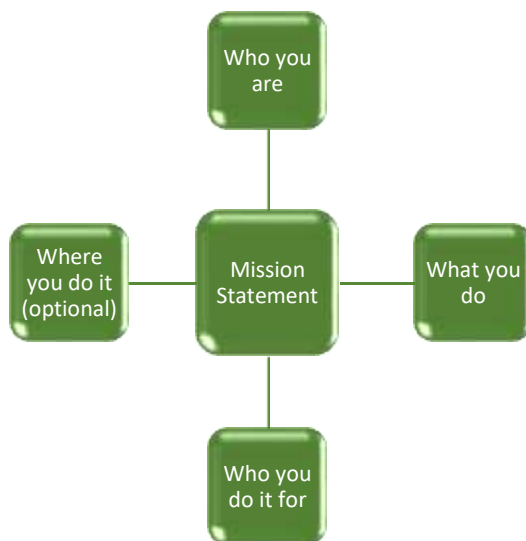
Figure 2. The four limbs of a mission statement

Additionally, the mission statement should have four limbs.