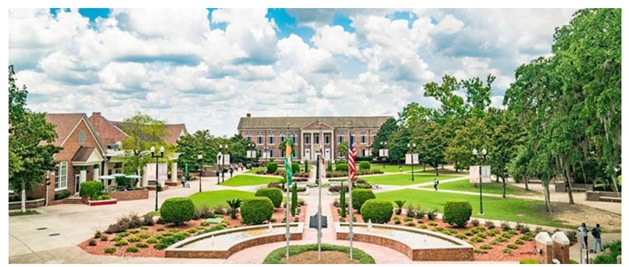
Figure 1: View of the FAMU campus.

Florida A&M University (FAMU) is a historically Black public university with its main campus in Tallahassee, Florida. The university was founded in 1887 and became a land-grant institution in 1891. Today, FAMU consists of 11 schools and colleges and a Division of Graduate Studies and Continuing Education, and enrolls nearly 10,000 students a year. As of 2022, FAMU has been the highest-ranked historically Black college and university (HBCU) for three consecutive years. FAMU's campus (Figure 1) sits on more than 420 acres within Tallahassee and includes facilities ranging from academic and research centers to office space, residence halls, gymnasiums, urban farming plots, and outdoor recreation.