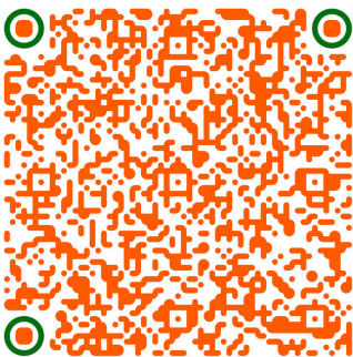
Student Code of Conduct

At Florida A&M University, we are committed to fostering a culture of honesty, responsibility, and mutual respect. As part of this commitment, we want to address a serious issue that affects both individual students and the broader academic community: the submission of false medical documentation to obtain excused absences.