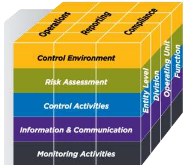
©2013 Committee on Sponsoring Organizations of the Treadway Commission. Used with permission.

Monitoring Activities – the use of evaluations to ascertain whether internal controls are present and functioning.