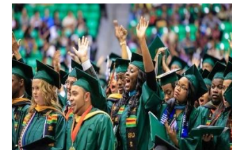
Historically Black Graduate Institutions