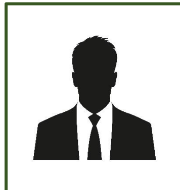
Future Employee #12 ERM Analyst (1800 Hours)

Additional assistance is expected through the Federal Work Study Program. This program allows for the ERM function to receive two student workers for approximately 15 hours per week during the Fall and Spring terms.