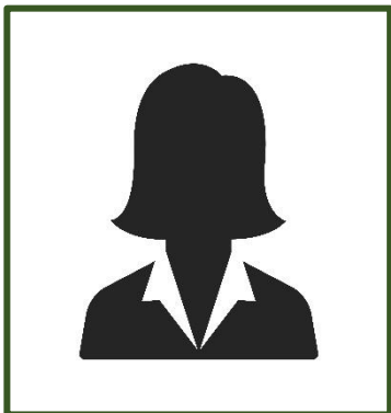
Future Employee #1 Operations ERM Coordinator (1800 Hours)

We have requested the following additional staff resources through the University's budget process for the 2023-2024 fiscal year. The work plan is built on the assumption that we will receive the requested positions.