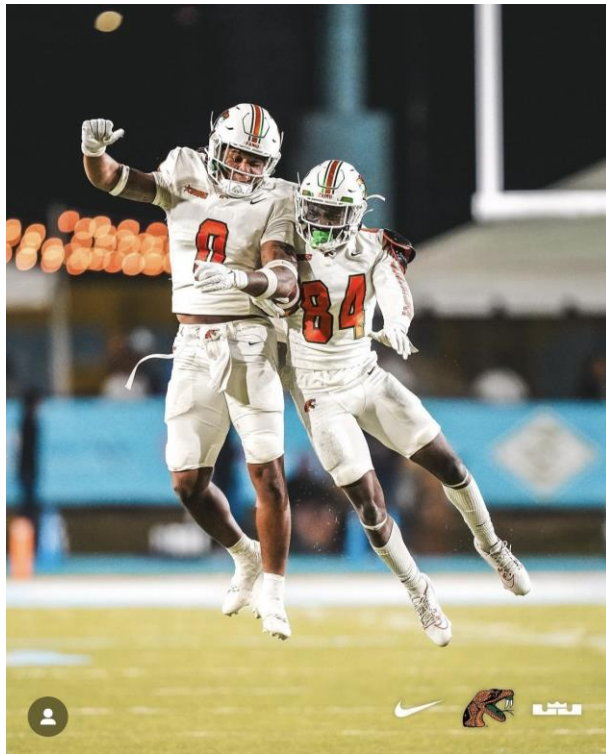
FAMU Football #16 NCAA FCS Rankings