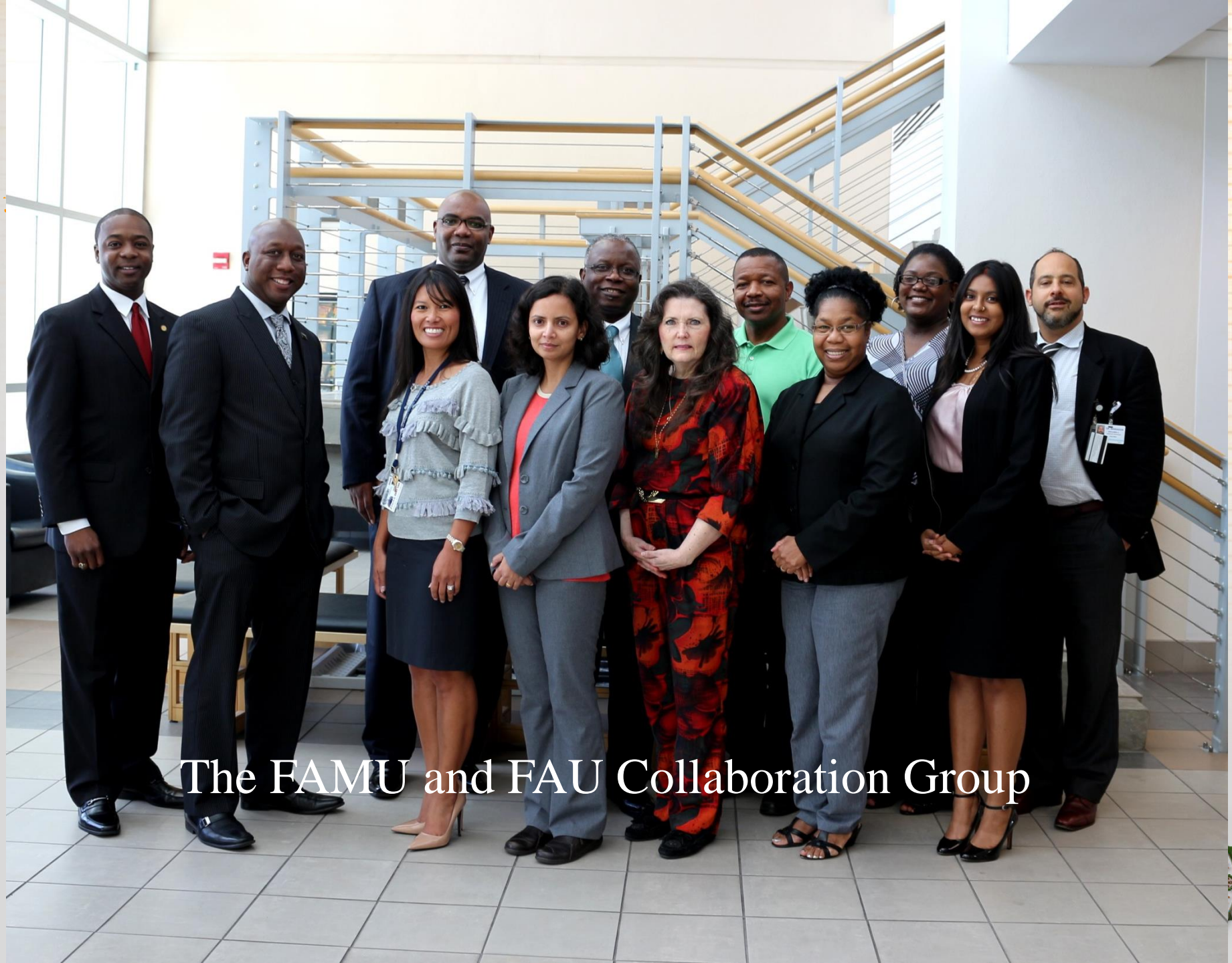
The FAMU and FAU Collaboration Group